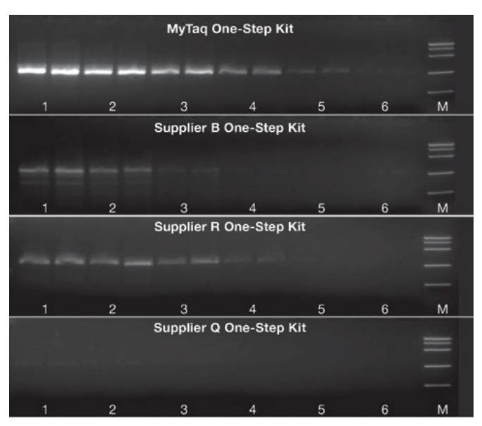
Fig. 3 High yield and sensitivity

The unique combination of a high-performance reverse transcriptase, MyTaq HS DNA Polymerase and an optimized buffer system, eliminates any non-specific amplification products, such as primer-dimers and reduces background smearing to deliver very high-yield PCR amplification (Fig. 3).